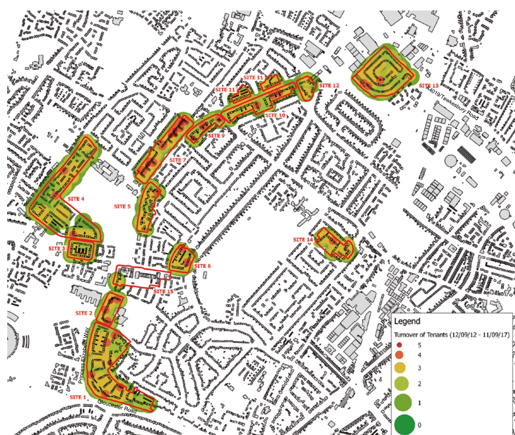
Number of property tenancies