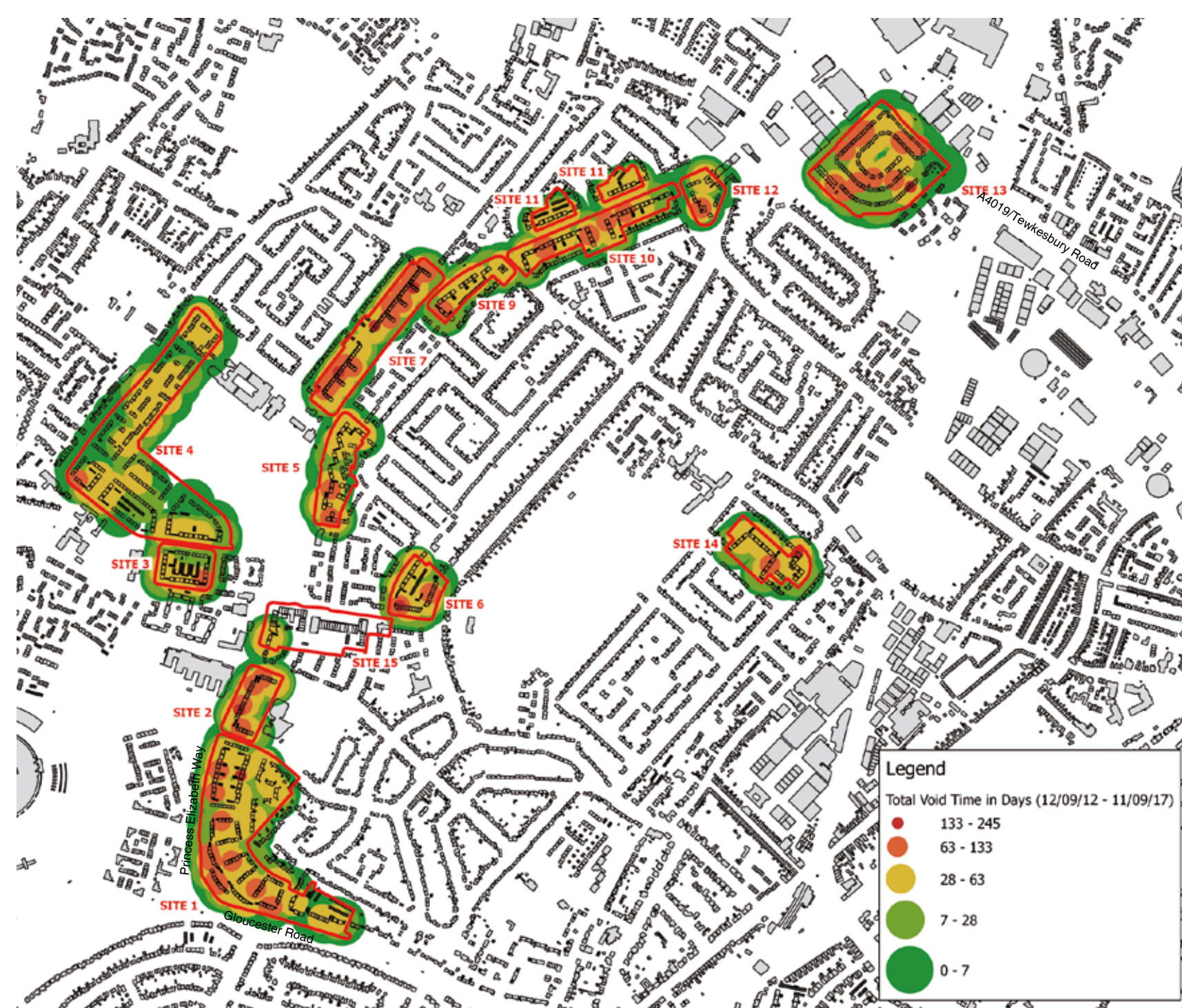
Number of empty property days