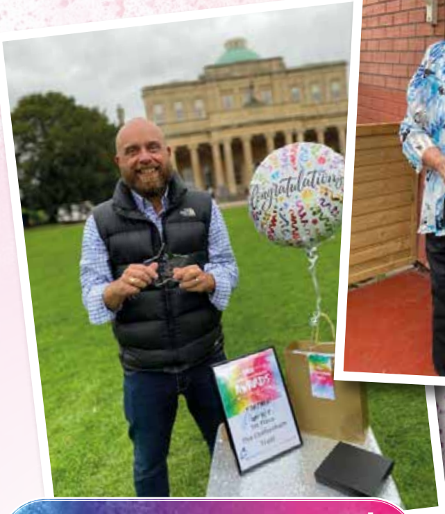
Partner Impact Award: The Cheltenham Trust